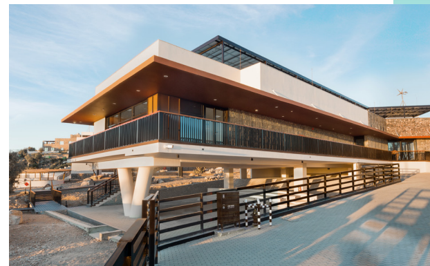
Our mountain training centre in Jabal Akhdar opened in 2022