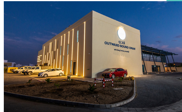
Our urban HQ and training centre in Al Khoud 6 opened in 2020